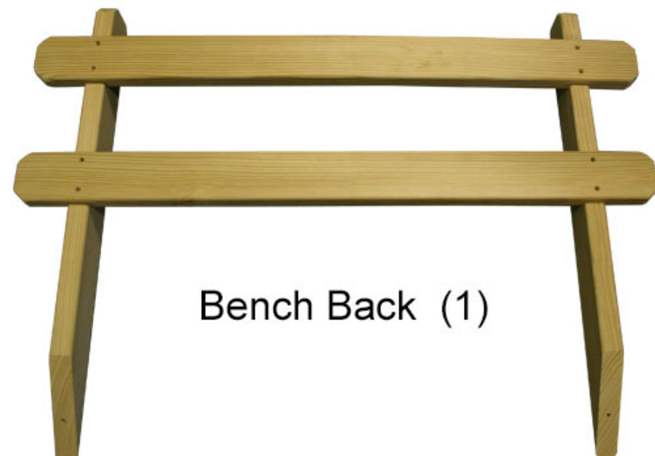
Bench Back (1)