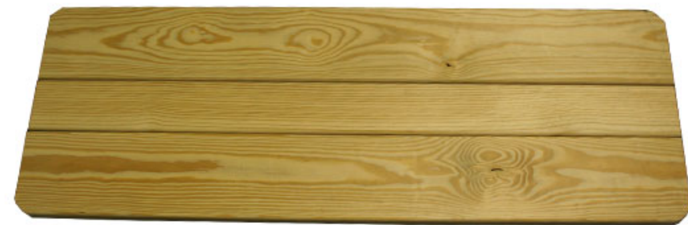
Bench Seat (1)