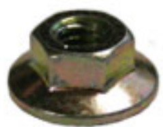
(4)- 7/16" Flange Nuts