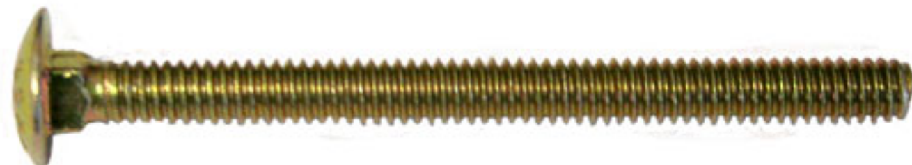
(4)- 3 1/4 x 1/4" Bolts